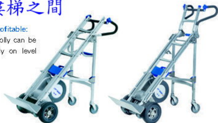
LIFTKAR HD Dolly Liftkar HD 推車型

Faster is more profitable: Dolly and Fold Dolly can be shifted effortlessly on level surfaces.