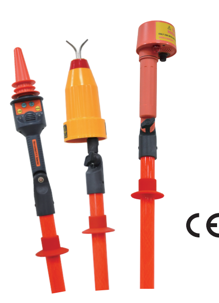
Attached to the High Voltage Proximity Detectors and Contact Capacitive Detectors