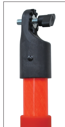
Universal Sunrise Fitting head