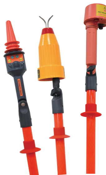
Attached to the High Voltage Proximity Detectors and Contact Capacitive Detectors