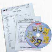
Test report Instruction manual CD