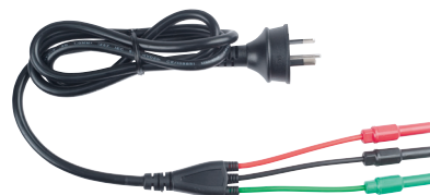
TEL_EL (Optional) (For 1812 EL, 1813 EL)