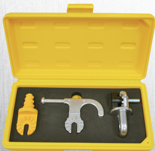
Carry case for the whole set accessories