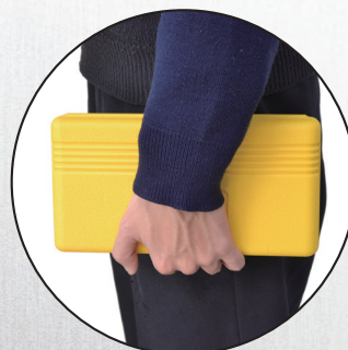
Small, lightweight, easy to carry