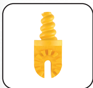
• ADP-HS120 Fuse extractor head Material : Nylon