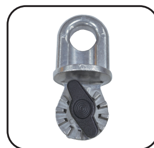
• ADP-278 Shotgun adapter Material : Aluminum alloy